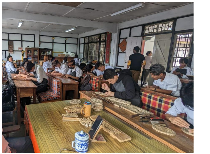
Directorate of Handloom and Handicraft